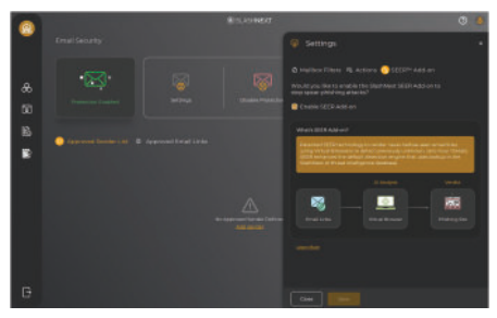
Deploy Through API

Visual illustration clearly and thoroughly explains the reason why emails are classified as malicious