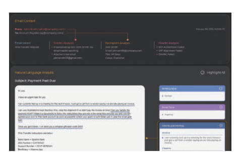
BEC Generative AI Threats Insights