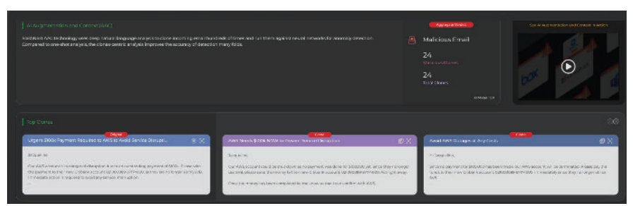
BEC Generative AI Created Clones